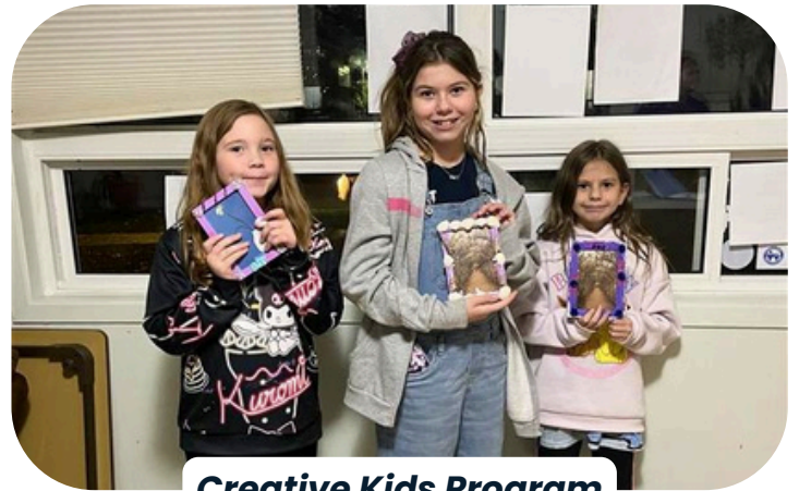
Creative Kids Program

This year we welcomed 6 before school care participants , with numbers growing in 2026.