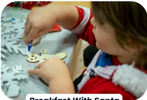
Breakfast With Santa

With 615 guests, 32 volunteers and 18 staff members helped bring the community together to enjoy 1,070 pancakes, share 326 gifts, and capture 976 moments with Santa.