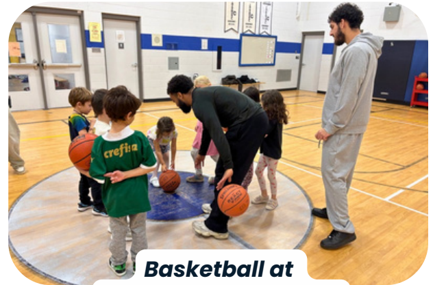
Basketball at After School Program