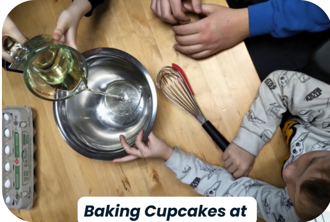
Baking Cupcakes at PA Day Camp