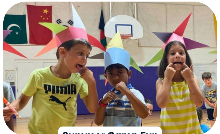
Summer Camp Fun