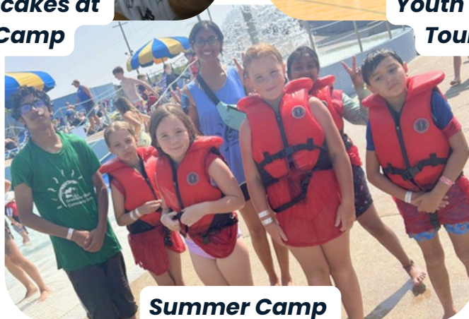
Summer Camp at Bingemans