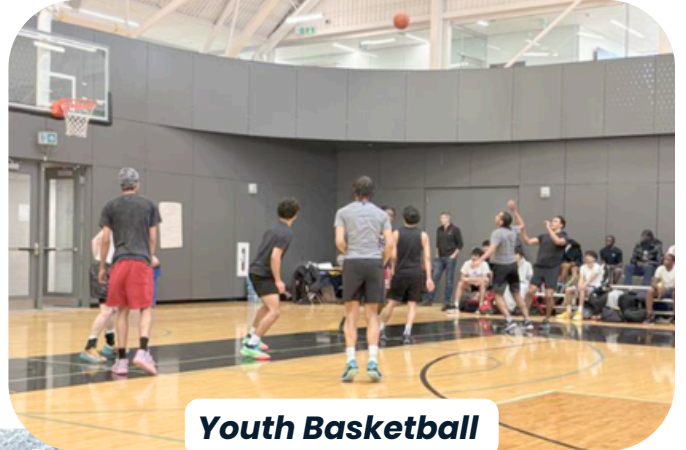
Youth Basketball Tournament