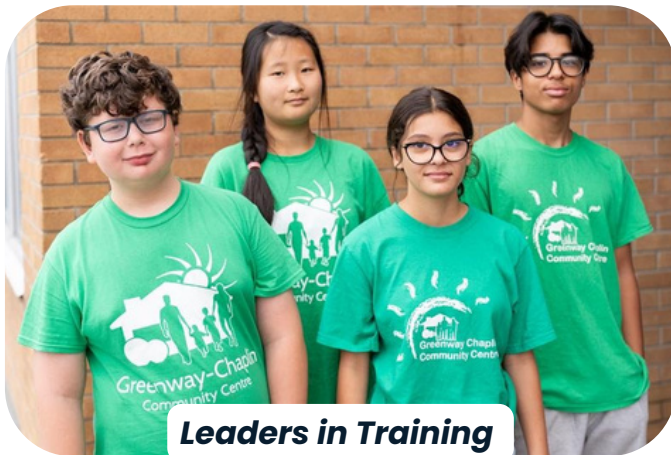
Leaders in Training Volunteers