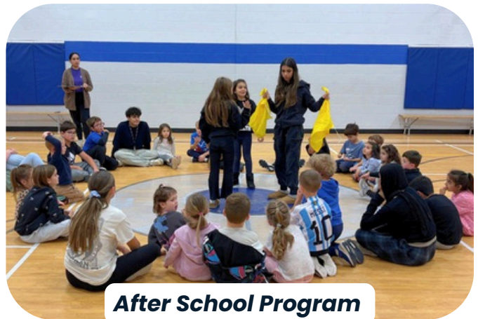
After School Program Circle Games Fun